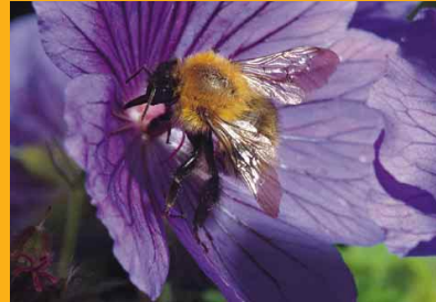
Bombus pascuorum (female)

Aquilegia Campanula Comfrey Everlasting Pea Geranium Foxglove Honeysuckle Monkshood Rhododendron Stachys Thyme