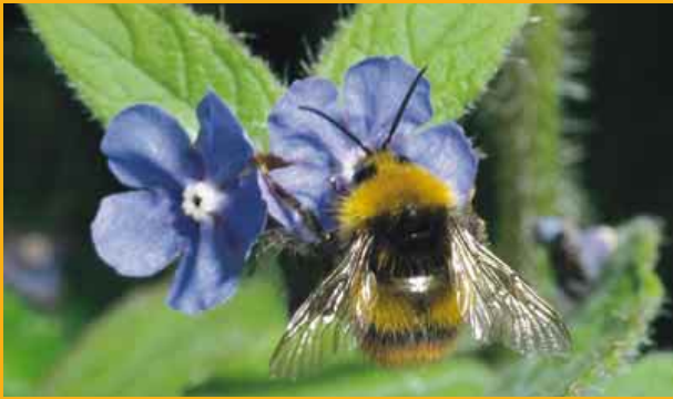
Bombus pratorum (male)