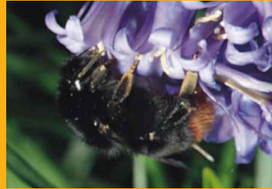
Bombus lapidarius (female)

Berberis Bluebell Bugle Flowering Currant Lungwort Pussy Willow Rhododendron Rosemary Dead-nettle Heathers