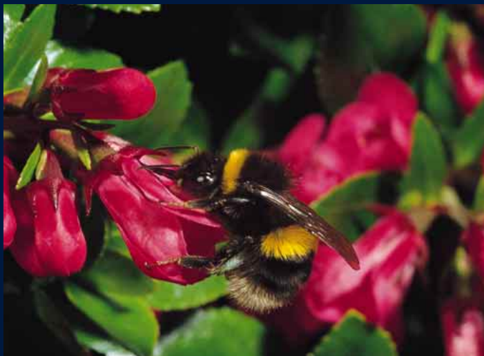
Bombus terrestris (female)