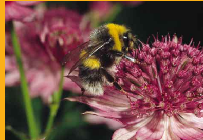
Bombus lucorum (male)

Cornflower Delphinium Fuchsia Lavender Rock-rose Scabious Sea Holly Heathers