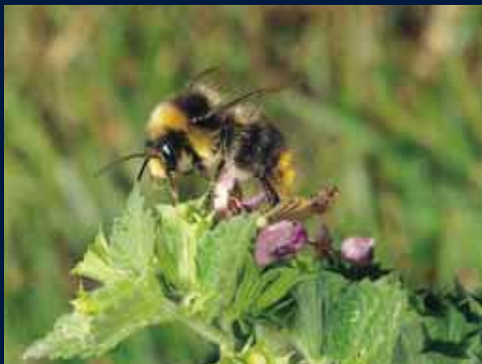
Bombus lapidarius (male)

Nest boxes for bumblebees are also available commercially but their success is very variable.